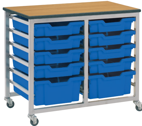
2 Columns, 12 Trays With Castors

Brighten up your classroom or office with these modern units