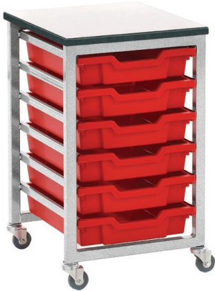
1 Column, 6 Trays With Castors

Brighten up your classroom or office with these modern units